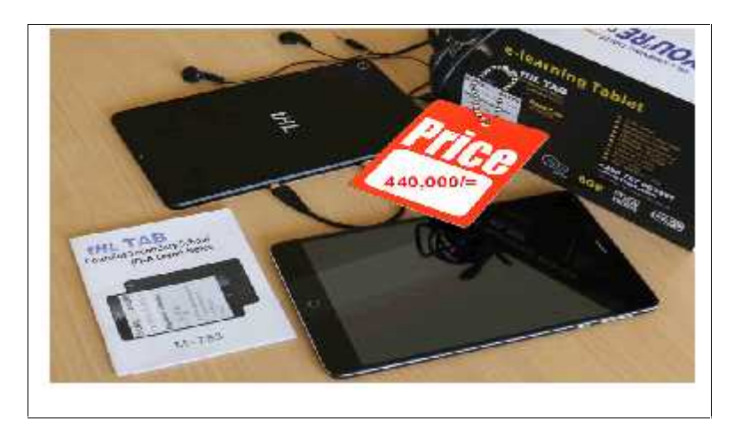
Figure 1: M-Learning Devices

The good practice being demonstrated by Twiga Hosting Limited (THL, 2018) has resulted in a role model for mobile learning. THL uses a Tablet known as the thl Tab (Figure 1) with secondary school learning materials that allow students to learn using ICT. The e-school, tHL 2.0 Revised edition available at the Google play store, encourage students to focus on academic material rather than unethical information through its parental control functions.