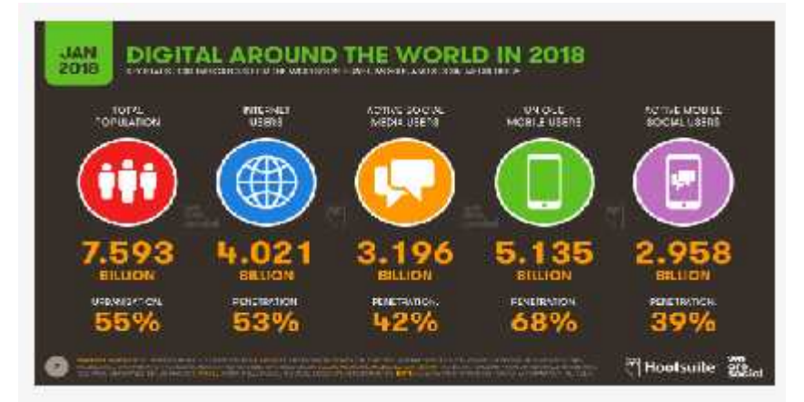
Figure 2: Digital around the world.

According to Kemp (2018), more than a quarter of the African population (425 million of 1272 million) has access to the Internet. While this represents a significant opportunity, it also brings great challenges and responsibilities. While literacy has decreased at a low rate, technology use has increased at a higher rate. Figure 2 below shows various uses of technology in relation to the global population. Mobile users are recorded at 39% of the population while the Internet user was 53% (Kemp, 2018).