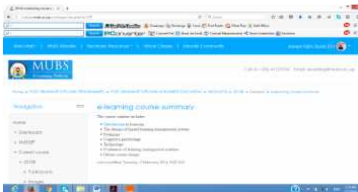
Figure 2: The e-Learning interface