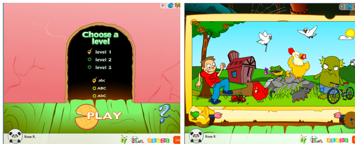
Figure 2: An ABRA activity

The gaming elements of ABRA are designed to engage children in reading and writing and to increase their motivation. In each activity (Figure 2), children follow a set of simple rules to progress towards a goal and once it is reached, the children are rewarded with a mini game. Adding to the software game-like feel, each ABRA character has a personal story the children can read or listen to and that reinforces the purpose and context of what they must do in each activity. The embedded support within ABRA tailors the degree of learner scaffolding offered as children interact with the tool. If they respond incorrectly, they are provided with suggestions or can seek help.