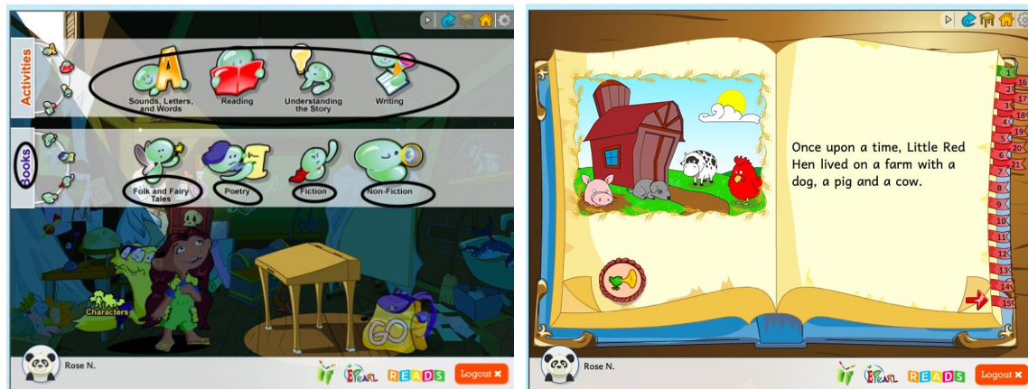
Figure 1: ABRA modules and books

The gaming elements of ABRA are designed to engage children in reading and writing and to increase their motivation. In each activity (Figure 2), children follow a set of simple rules to progress towards a goal and once it is reached, the children are rewarded with a mini game. Adding to the software game-like feel, each ABRA character has a personal story the children can read or listen to and that reinforces the purpose and context of what they must do in each activity. The embedded support within ABRA tailors the degree of learner scaffolding offered as children interact with the tool. If they respond incorrectly, they are provided with suggestions or can seek help.