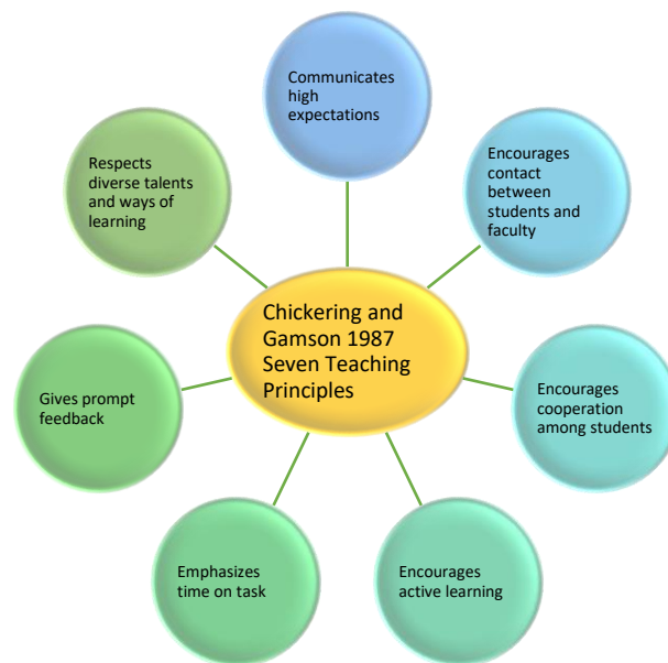
Figure 1: The Seven Teaching Principles by Chickering & Gamson (1987)

These principles are not organized in any specific hierarchy in the seminal works of Chickering & Gamson (1987, 2006), nor were they linked to online or virtual learning back then, having been developed as a guide for face-to-face learning. About a decade ago, these principles began to emerge as a tool for distance learning and online teaching. For example, the Dutton e-Education Institute at the University of Pennsylvania developed a faculty peer review tool based on these principles, which they believed are valuable to online teaching, but noted there are nuances due to the online environment (Taylor, 2010). Although these seven principles of good practice have been documented many times in the literature, the importance of this study is the gap in literature, specifically related to online masters' courses and the participants who in this study provided a definition of effective online teaching. Bradford & Peck (1997) used these principles for teaching accounting education by focusing on student motivation and active learning.