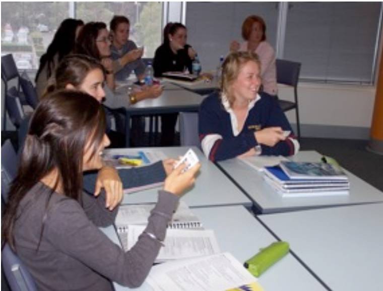
Figure 2: Wireless keypads used in tutorial setting