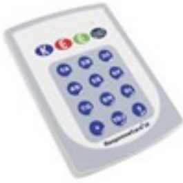
Figure 1: Wireless Keypad