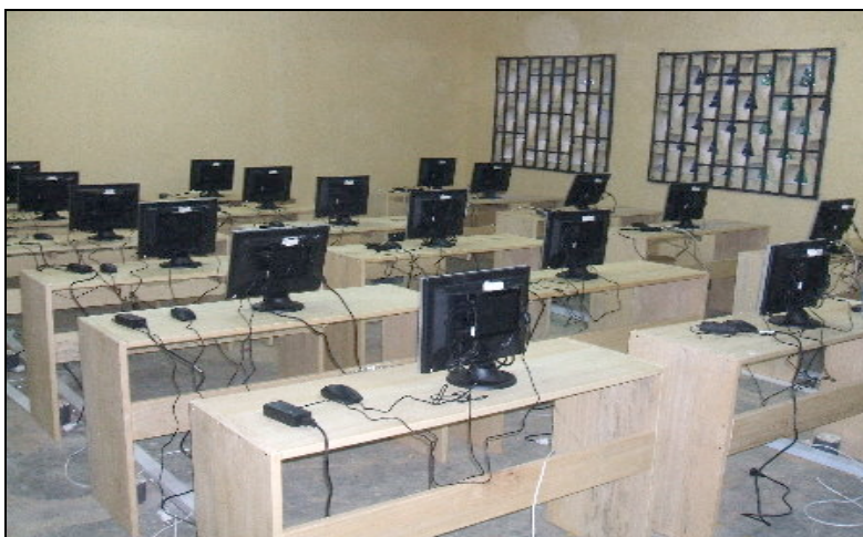
Figure 2: Installing computers in the laboratory

The contract with schools normally lasts three years and it is estimated that by then, the school authorities and PTA would have acquired enough experience to sustainably run the project without ADCOME. The project is thus handed over to the school at the end of the contract, else, the contract is renewed and ADCOME continues managing it for an agreed period.