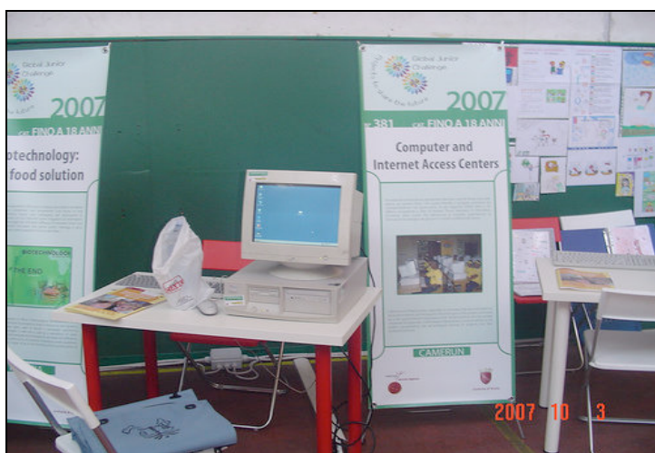
Figure 4: CIAC project exhibition at the 2007 GJC award

In April 2007, the project was recognized as the best case practice CSR project within network of 21 countries in Africa and Middle East under the MTN Group (MTN Cameroon started supporting project rollout strategies ending 2004 which contributed greatly to out reach to many schools in rural communities)