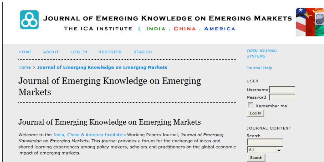
Figure 2: Screenshot of PKP Open Journal Demo

McDermott (1999) highlights the importance of using information technology to support communities that share knowledge. He emphasizes how technology can help organize, maintain, and distribute that knowledge to others in the community. Between the ICA Institute and its participants, trust creates a possible imbalance of power. For example, visitors to the ICA Institute website expect information disseminated by the highly credible board members to be reliable; therefore, the ICA Institute must not betray this trust by distributing misleading or biased messages. By building a global editorial review board and using the review tools available through the PKP's Open Journal system, the ICA Institute is better able to ensure the credibility of the knowledge gathered.