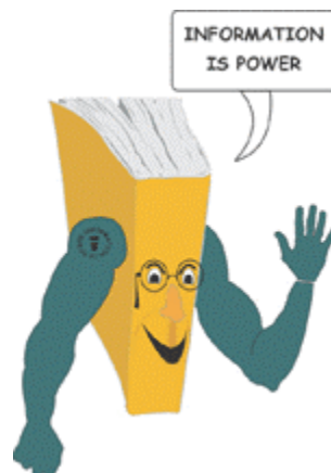
Diagram 1: Muscled Book

On the suggestion of the Instructional Designer, the team came up with an "anchor", a story line character, serving as instructional guidance throughout the online course to introduce the information skills component of the programme. This character enhanced students' identification with the ILS course. This is a "muscled" book, symbolising that "Information is Power".