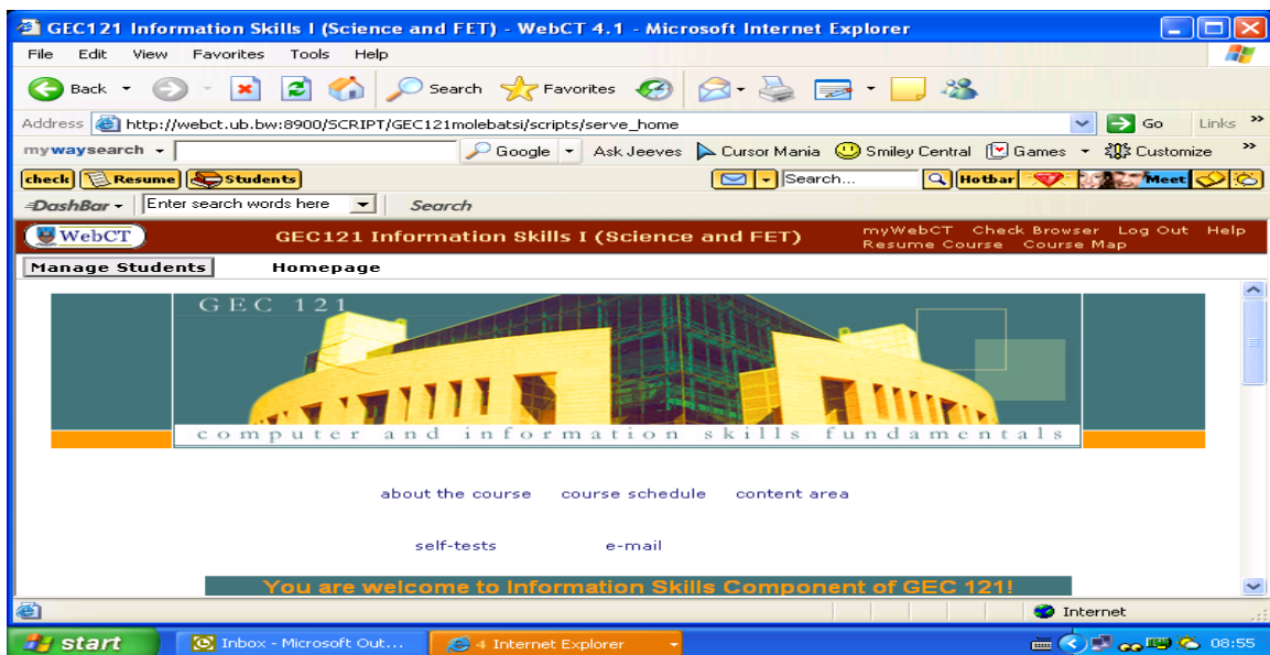
Figure 2: Top section of home page

The Instructional and the Graphic designer from CAD were very instrumental to the final design of the online course. They helped in designing the logo, the html template, the welcome page as well as all the graphics that illuminated the online course. Two members of the team (who had been trained) participated in the production of the html content pages, and uploading of the pages to WebCT. See figures 2, 3, and 4 depicting the homepage as it appears in WebCT.