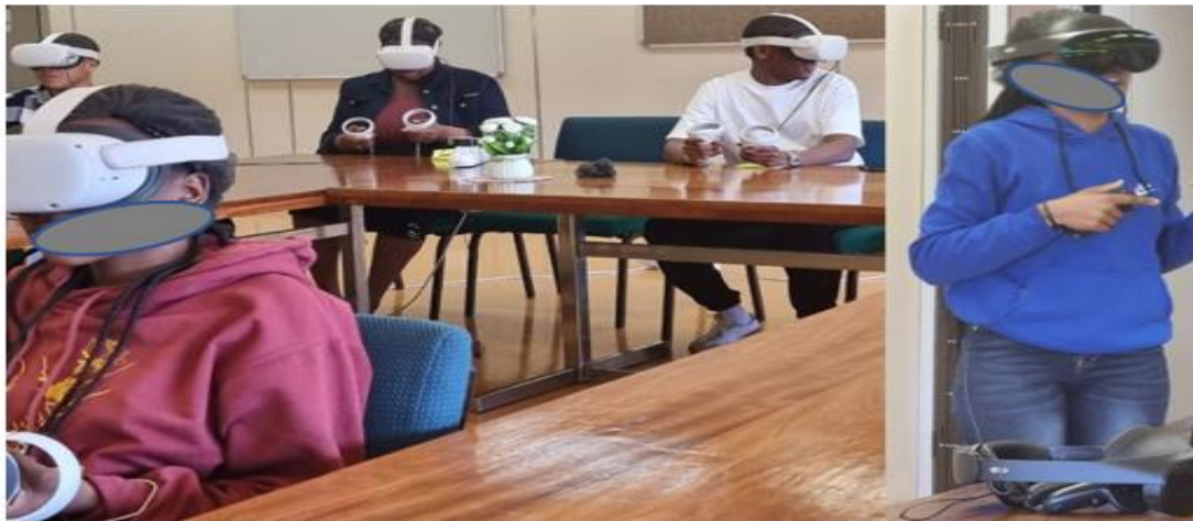
Figure 3: Pre-service teachers navigating the LaViR application

The quantitative survey form was designed using Google Forms. The respondents filled in the answers by clicking appropriate boxes and submitted their responses to a Web server, which was used to administrate the survey. All respondents' inputs were recorded in an Excel table. Data were analysed using descriptive statistics and correlation analysis. Furthermore, a reliability analysis was conducted on the scales using Cronbach's Alpha, and the results showed that the internal consistency for the constructs was moderate to high, with performance expectancy at 0.58, effort expectancy at 0.76, and attitude at 0.79. These values indicate that the scales have a reasonable degree of reliability, as they are all above the threshold of 0.50, as suggested by Hinton, McMurray,