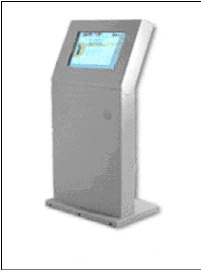
Figure 2: Rural Kiosk Machine

The Rural Kiosk Machine will contain the following information in local language: