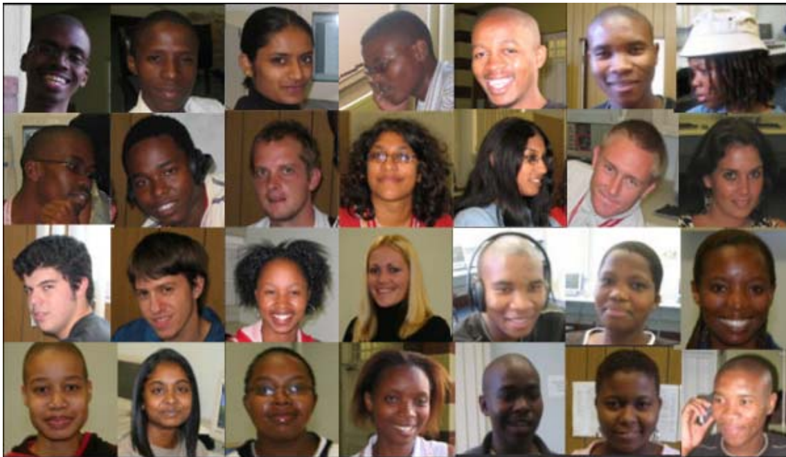
Figure 2: Some of the 100 DIT Online authors in the first two semesters

Each Monday, the class reviewed the work it had produced the week before, while they were able to access an html page in their WebCT classroom providing the lecturer's written comments on the original version of every story published. This was an attempt to break down one-way feedback between lecturer and student, and expose the interaction to all students, in the belief that they could learn from one another's successes and shortcomings. Each week, the lecturer would award a small prize for the best article published in the previous week. This helped to motivate students and to enhance the competitive edge in the classroom.