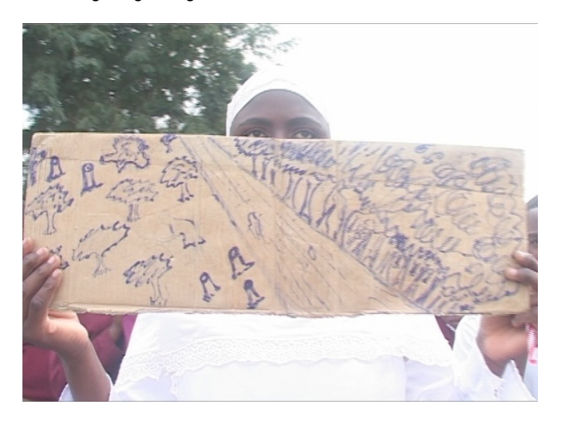
Figure 3: Student presenting and explaining her group's project

After the groups had identified their topic, they were given one week to work on their projects (Kihoza 2011). Up to this point, researchers had been involved with the students but from this point onwards the teachers were provided with a list of project titles and it was suggested that they provide the students with guidance, if and when required. The groups had to complete the projects in addition to their regular classes. The research team did not contact the groups during this week. The groups produced a theoretical document and showed, in practice, that the knowledge regarding environmental conservation had been well understood.