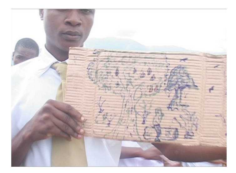
Figure 4: Student presenting and explaining his group's project

In the final stage of the PBL process the students were asked to present their projects. The aim was to describe the problem from a chosen viewpoint, summarise their understanding of the problem and discuss their solutions. Some of the presentations were conducted inside the