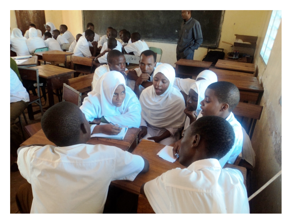
Figure 2: Students discussing the issue of forest fires