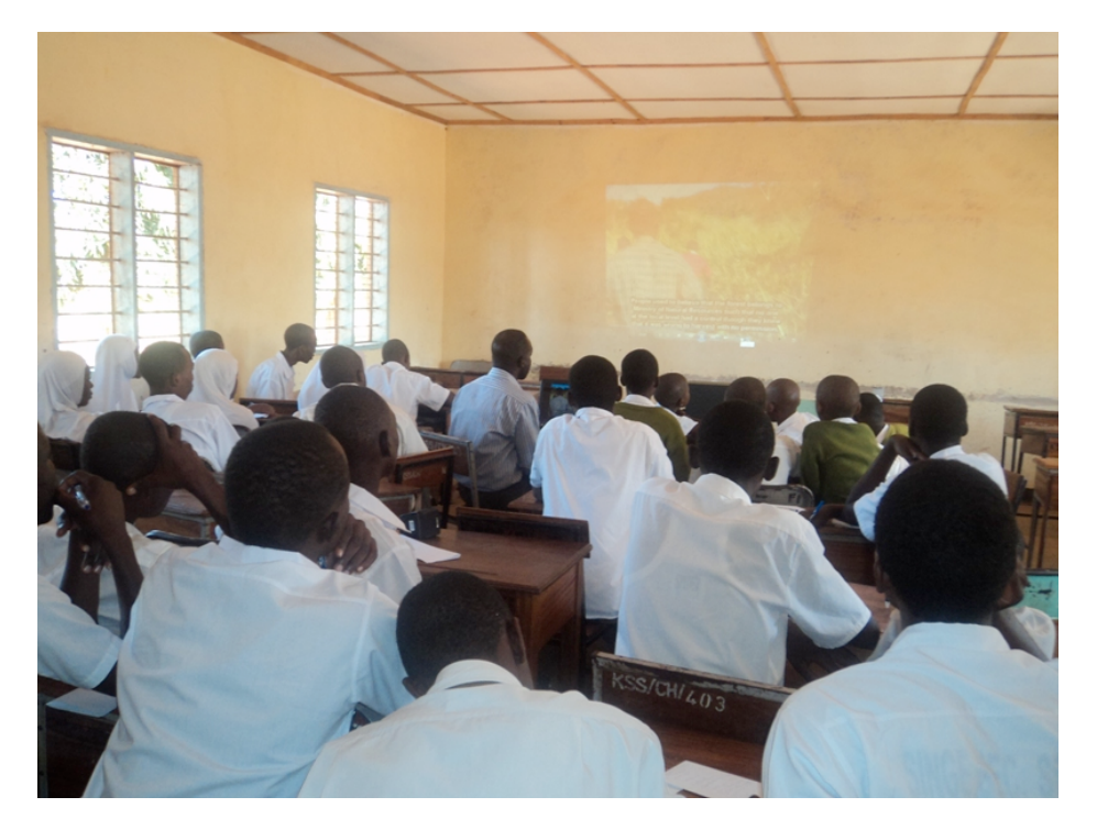
Figure 1: Students watching CASC video

The first step in the study was for the students to watch the three videos: a local CASC media artifact, the forest fire video from another context and a video explaining the PBL process. In Figure 1, the students in the experimental group are watching the local CASC artifact video.