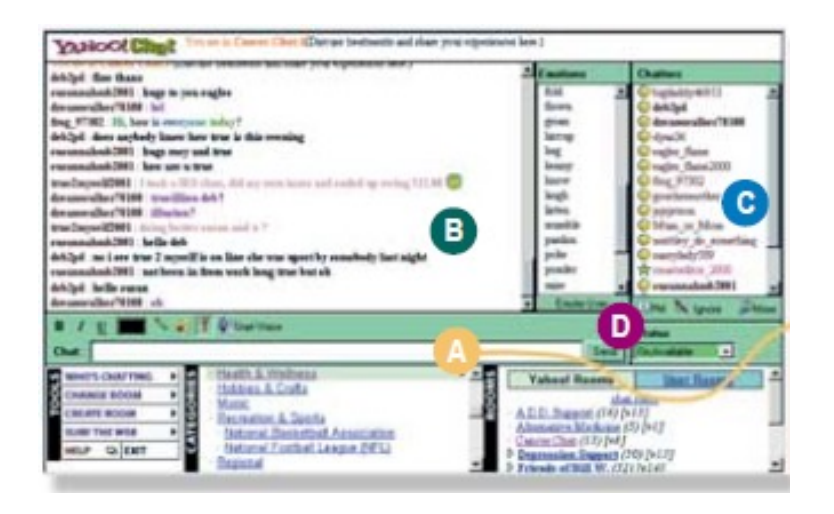
Figure 5 : A snapshot of Yahoo Chat room (Phelps, 2010, p. 1). Label A is the input box (You can see "Chat" at the beginning of the field); B is the message window; C is the users' list; D is "Send" button.