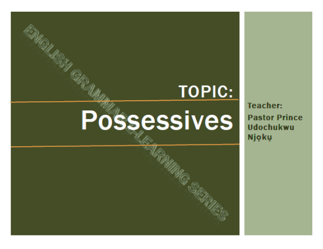
Figure 1: Topic and Author slide of a presentation for teaching a topic in English Grammar

created to self-run, partially or completely. With the partial self-running option, the teacher prepares slides as visual aids. When the presentation is ready, it can be copied into CD-ROMs or flash disks or memory cards. It is important to ensure that the PC has at least one CD-rewritable drive or universal serial bus (USB) port or memory card slot to support copying. A PC that has all of these is better. Students can then be organized into groups in the classroom. Each group will sit before a PC with one of the CD-ROMs or flash disks or memory cards to watch the slideshow while the teacher physically narrates from his/her own corner. Microphones and loud speakers will be needed if the class is very large. As reported by International Institute for Communication and Development (2010, p. 3), a Zambian teacher says (of Microsoft PowerPoint): "Using ICT applications such as PowerPoint helps us enhance our visual presentations. With computers and the internet, my students learn more easily about their subjects."