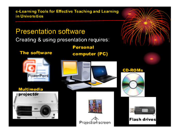
Figure 2 : A slide illustrating the apparatus required for creating, showing and distributing a presentation. It may be one of two or more slides for explaining the sub-topic 'Presentation Software'.