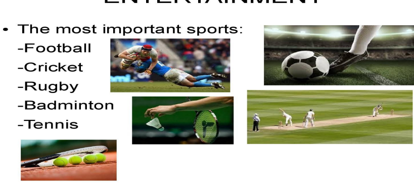
Figure 6: The entertainers' presentation

The entertainment researcher speaks about cultural aspects such as music, bands and other important celebrities born there.