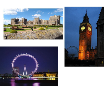
Figure 4: The historians' presentation