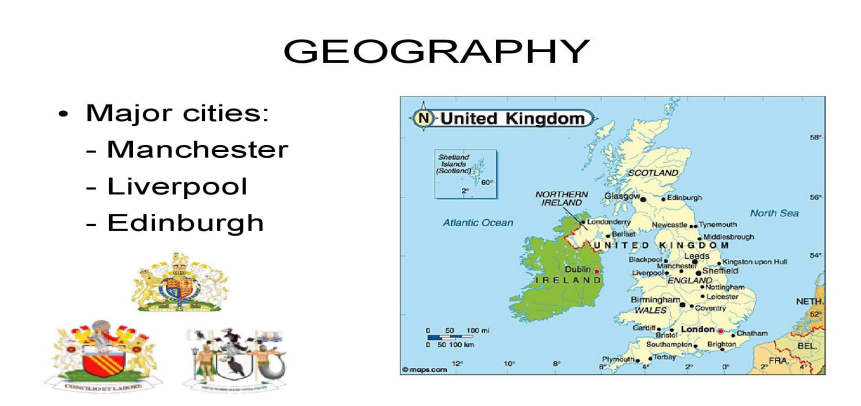
Figure 3: The geographers' presentation

The geographer makes a small presentation about the location of the country, its main cities, as well as other aspects such as the meaning of the flag, currency and other languages.