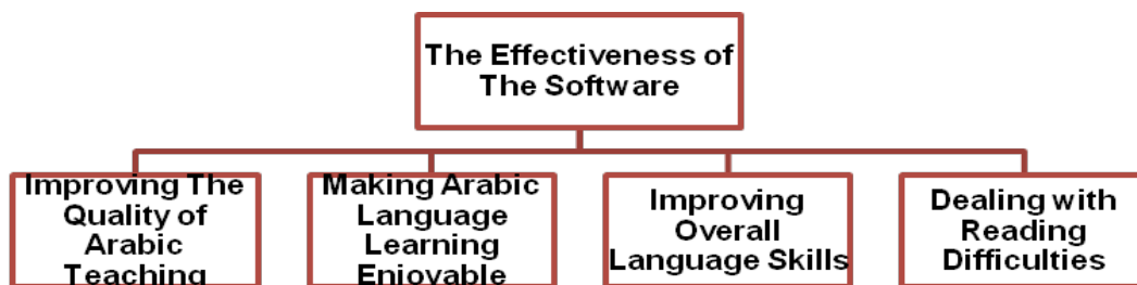
Figure 1. The effectiveness of the software

The central focus of this study was to assess the teachers' perceptions of the effectiveness of using designed software in ALTL. To answer question 1: How effective is the use of AL software in ALTL from Arabic teacher's perceptions? Four sub-themes emerged regarding the effectiveness of using the software: "Improving the quality of Arabic teaching", "making Arabic language learning more enjoyable", "improving overall language skills"; and "dealing with reading difficulties". The following section discusses the effectiveness of using the designed software from teachers' perspectives, and they are summarized in Figure 1.