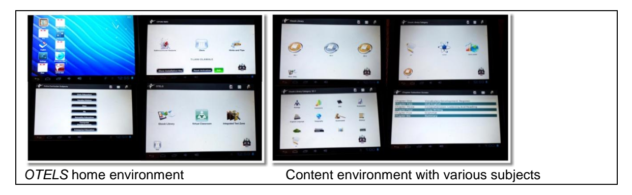
Figure 2: OTELS Home and Content Environment

Figures 2 and 3 below present screen shorts that illustrate different environments on the Qpón-Ìmò Technology Enhanced Learning System ( OTELS ).