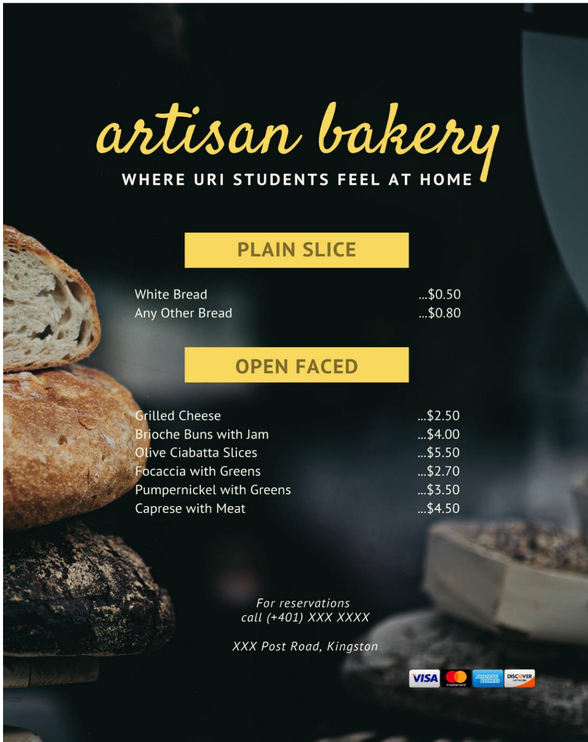
Figure 5: Illustration of Food Menu