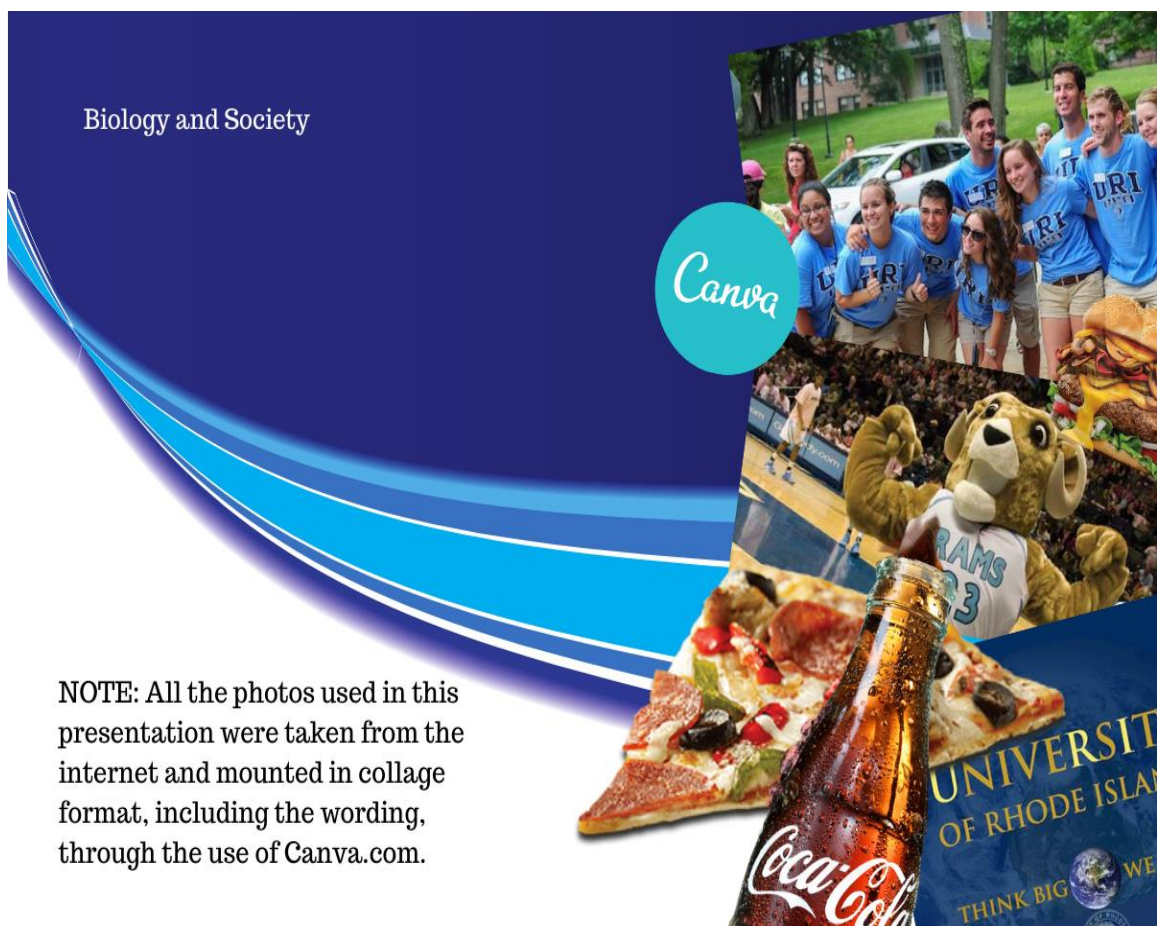
Figure 1: Illustration of how Wavelike Lines Complement the Main Color

the ZOOM screen. One establishes a background which is repeated from slide to slide. One may instead alter some of the slide backgrounds. Canva offers several background color categories and textures including gradients, patterns, and abstracts. Background colors can be selected that match or reinforce an organization's colors or themes. For example, for university communications, one can select colors that match the university's identifying colors, thus reinforcing the affiliation with the university. The University of Rhode Island (URI) uses navy blue as a predominant background color. It contrasts with white print. To increase aesthetics, additional shades of blue can be added into the background. The URI athletic department adds Keaney blue, that is the light blue historically used by URI athletes, to its sports clothing and memorabilia. A URI academic designer may add streaks or a wavelike line of these colors at the edge of each slide to enhance the image. Figure 1 demonstrates an example of this graphic design tactic developed by the main author, using royalty free images.